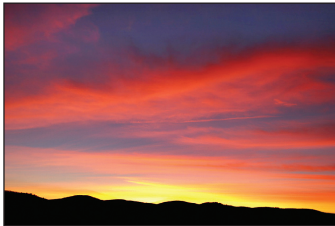
The Biblical Day begins and ends when the sun is well below the horizon; beginning in the early dawn; ending after dusk.

to tell Peter and John. This must have taken some time. While she made her way back with Peter and John, the other two women arrived at the tomb at about sunrise . They left before the others got there with Mary Magda-